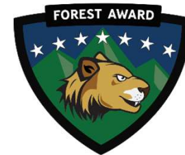
Mountain Lions Age 9-10