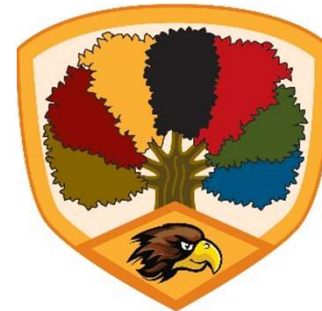
Hawks Age 7-8