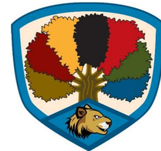
Mountain Lions Age 9-10