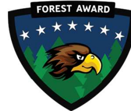
Hawks Age 7-8

Earned through continued participation in the program within his age group (typically year two in a patrol).