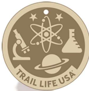
Science and Technology Sports and Fitness