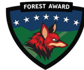
Foxes Age 5-6