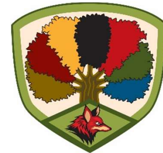
Foxes Age 5-6